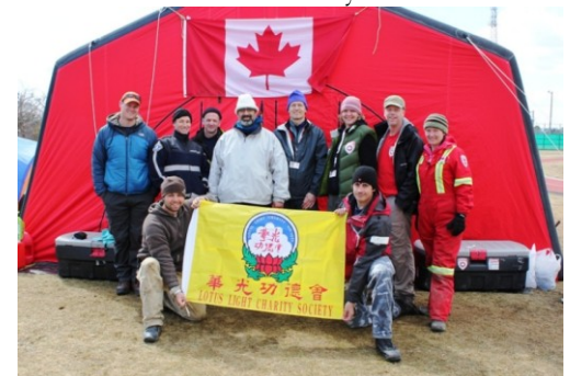
LLCS supported the Canadian Medical Assistance Teams Japan Earthquake, Tsunami and Nuclear Disaster Relief